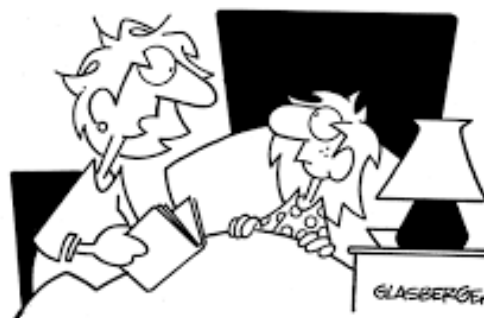
"Yes, the disciples followed Jesus... but not on Twitter."